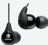
Shure, I can't hear you with these noise canceling bass thumping ear buds.

bang for the buck. The MacBook Pro's little sibling offers top notch performance in the price range for $1,099 to $1,499 depending on configuration. Of course, this Apple has the ability to run Mac OS X and Windows XP operating systems simultaneously and sports Apple's very cool sense of style.