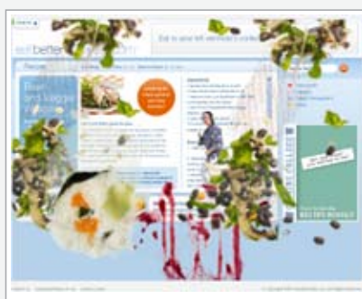
Yup, that is bean and veggie wraps up in your face.

Site URL: thegoodfoodfight.com Traffic Estimate: 59,300 per month Type of Site: Flash Based Entertainment, Education