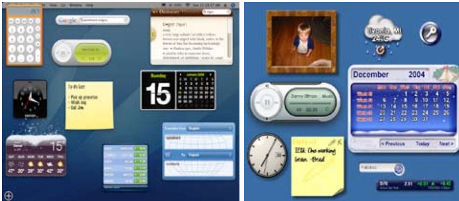
Mac OS X Dashboard VS Desktop X Objects

Widgets, a vague term used to describe a vague concept