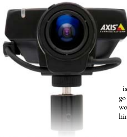
Adding a camera can deter potential thieves.

Theft has always been an issue but most people don't take precautions until it's too late.